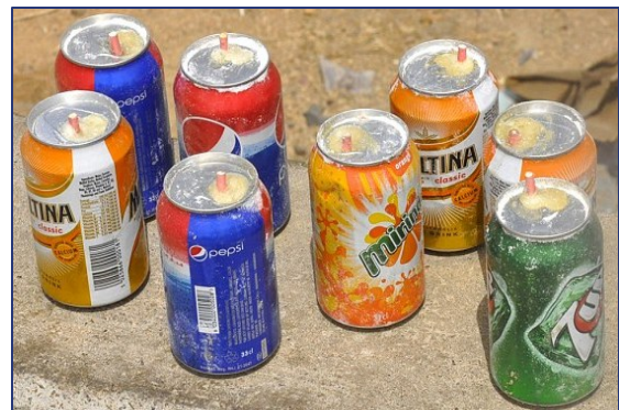
Explosives recovered in northern Nigeria

However, more routine Boko Haram attacks involve gunmen armed with AK-47s on motorcycles or motorized tricycles (rickshaws). Homemade IEDs stuffed into packaging, such as soft drink cans, are another common and crude means of inflicting violence. In this sense, while Boko Haram has demonstrated the capability to engage in large-scale terrorist violence, the organization conducts smaller-scale attacks throughout northern Nigeria on an almost daily basis.