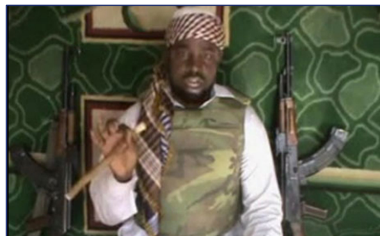
Current Boko Haram Leader Abubakar Shekau

On 19 February 2013, armed gunmen kidnapped a family of seven French tourists, including four children, near Waza National Park in Cameroon, close to the Nigerian border. While foreign targets have been the subject of kidnappings in northern Nigeria, Boko Haram previously denied involvement in such operations. 23 However, a March 2013 video featuring Boko Haram leader Abubakar Shekau claimed the abduction, signaling a shift in tactics. 24 In fact, until that event, Boko Haram had also been careful to avoid violent incidents on the turf of Nigeria’s neighbors, despite increased reporting regarding external activity. During the video, however, Shekau primarily complained about the detention of sect members in Cameroon, signaling a locally rooted motivation for the incident. 25 Nonetheless, these complaints follow a similar pattern of