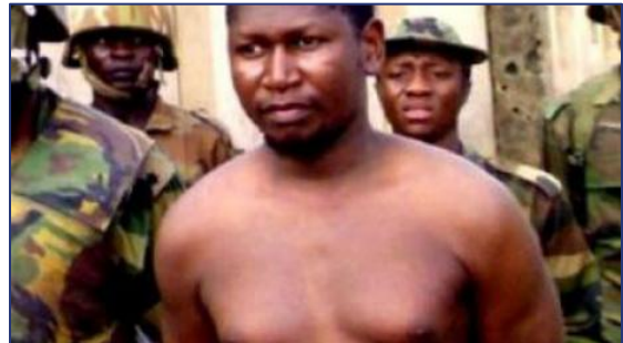
Boko Haram leader Muhammad Yusuf, shortly before his death in July 2009

In July 2009, Muhammad Yusuf, the founder of Jama'atu Ahlissunnah Lidda'awati wal Jihad, or "People Committed to the Propagation of the Prophet's Teachings and Jihad," was killed while in police custody. 1 Yusuf's movement, known in local parlance as Boko Haram, or Hausa for "Western education is forbidden," had been part of a five-day uprising across four Nigerian states, resulting in over 700 deaths. The army was called in to quell the violence, and with Yusuf's suspicious death, many assumed the movement was broken.